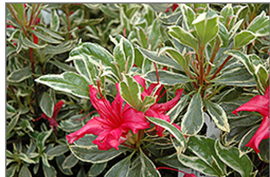
Girard's Variegated Gem Azalea flowers