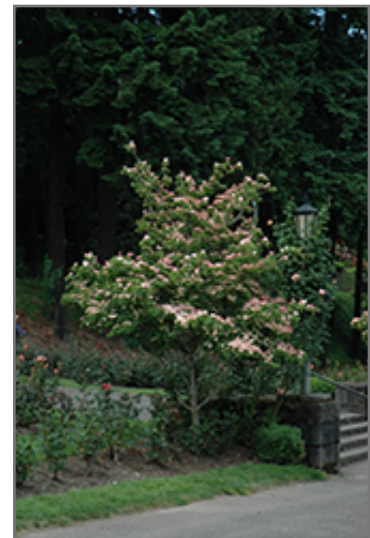
Heart Throb Chinese Dogwood in bloom