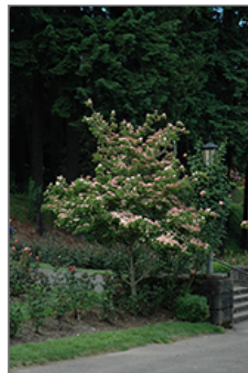
Heart Throb Chinese Dogwood in bloom