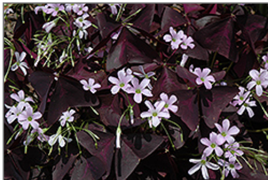
Purple Shamrock flowers