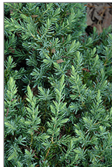
Blue Pacific Shore Juniper foliage

Blue Pacific Shore Juniper is recommended for the following landscape applications;