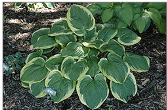
Mint Julep Hosta