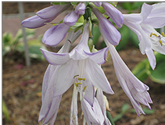
Fried Bananas Hosta flowers

Fried Bananas Hosta will grow to be about 24 inches tall at maturity extending to 3 feet tall with the flowers, with a spread of 4 feet. When grown in masses or used as a bedding plant, individual plants should be spaced approximately 4 feet apart. Its foliage tends to remain dense right to the ground, not requiring facer plants in front. It grows at a fast rate, and under ideal conditions can be expected to live for approximately 10 years. As an herbaceous perennial, this plant will usually die back to the crown each winter, and will regrow from the base each spring. Be careful not to disturb the crown in late winter when it may not be readily seen!