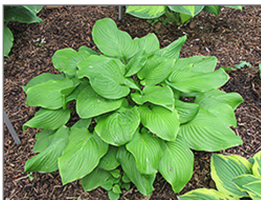
Fried Bananas Hosta