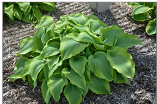
Atlantis Hosta