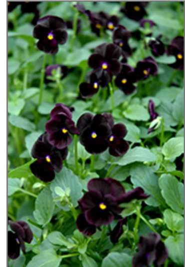
Sorbet Black Delight Pansy flowers

This plant will require occasional maintenance and upkeep, and should only be pruned after flowering to avoid removing any of the current season's flowers. Deer don't particularly care for this plant and will usually leave it alone in favor of tastier treats. Gardeners should be aware of the following characteristic(s) that may warrant special consideration;