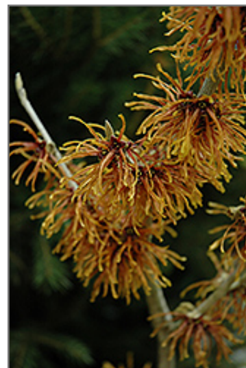
Jelena Witchhazel flowers