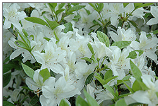
Palestrina Azalea flowers