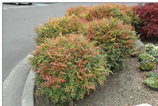
Sienna Sunrise Nandina