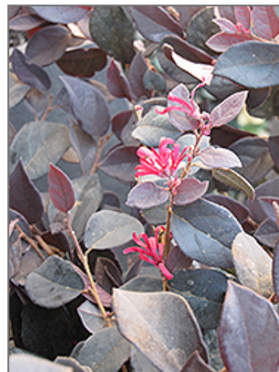
Purple Pixie Fringeflower flowers

Purple Pixie Fringeflower is recommended for the following landscape applications;