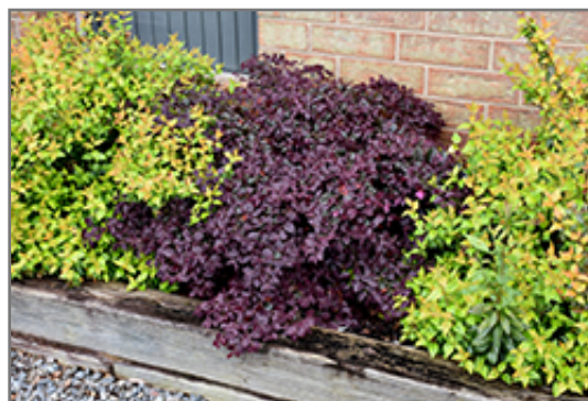
Purple Pixie Fringeflower