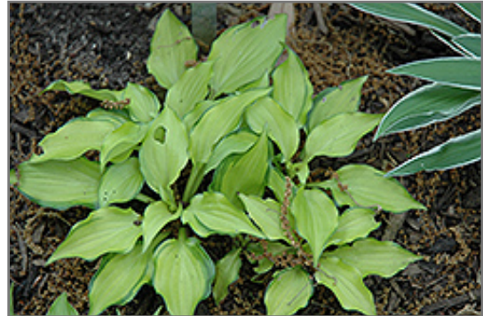
Cracker Crumbs Hosta