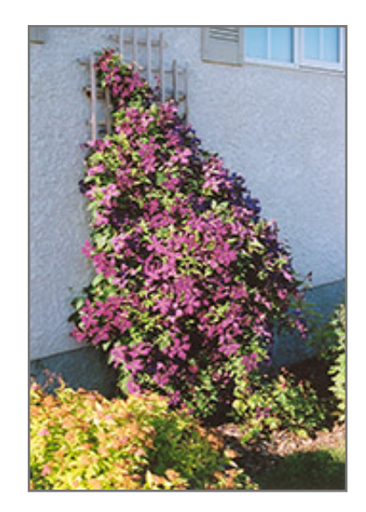
Polish Spirit Clematis in bloom

1020 NW Broad St Murfreesboro, TN 37129 www.MartinsHomeandGarden.com 615-867-7121