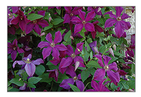
Polish Spirit Clematis flowers