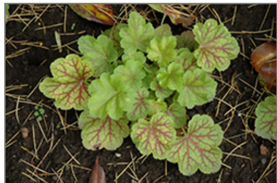
Electric Lime Coral Bells