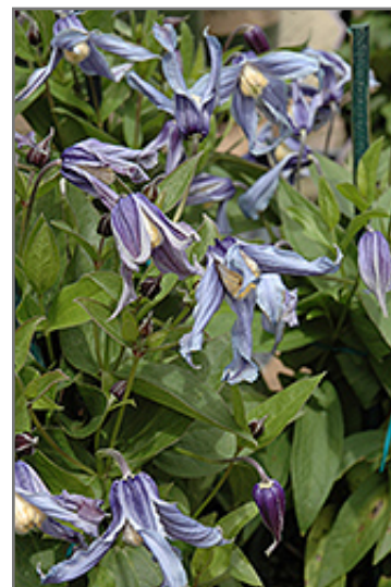
Caerulea Solitary Clematis flowers