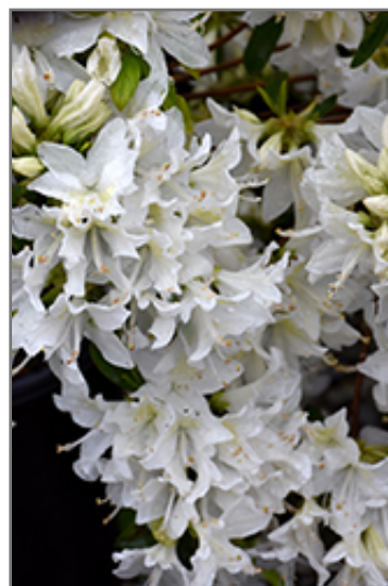
Cascade Azalea flowers