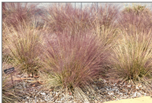
Hairawn Muhly in fall