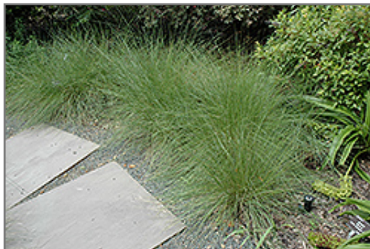
Hairawn Muhly

This is a relatively low maintenance plant, and is best cleaned up in early spring before it resumes active growth for the season. Deer don't particularly care for this plant and will usually leave it alone in favor of tastier treats. It has no significant negative characteristics.