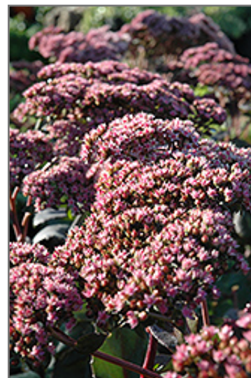
Maestro Stonecrop flowers

This is a relatively low maintenance plant, and is best cleaned up in early spring before it resumes active growth for the season. It is a good choice for attracting bees and butterflies to your yard, but is not particularly attractive to deer who tend to leave it alone in favor of tastier treats. It has no significant negative characteristics.