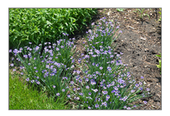
Lucerne Blue-Eyed Grass in bloom