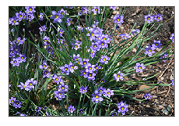
Lucerne Blue-Eyed Grass flowers

Lucerne Blue-Eyed Grass is a fine choice for the garden, but it is also a good selection for planting in outdoor pots and containers. It is often used as a 'filler' in the 'spiller-thriller-filler' container combination, providing a mass of flowers and foliage against which the larger thriller plants stand out. Note that when growing plants in outdoor containers and baskets, they may require more frequent waterings than they would in the yard or garden.