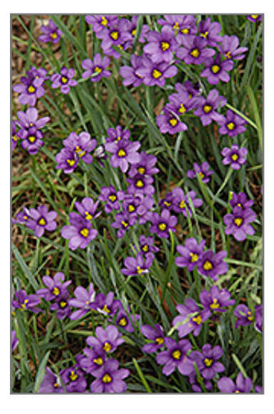
Lucerne Blue-Eyed Grass flowers

Lucerne Blue-Eyed Grass is an herbaceous perennial with an upright spreading habit of growth. Its medium texture blends into the garden, but can always be balanced by a couple of finer or coarser plants for an effective composition.