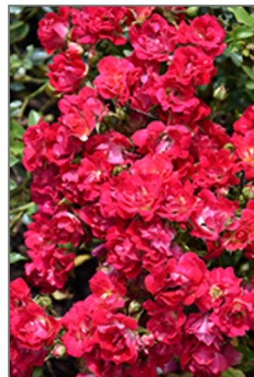
Red Drift Rose flowers