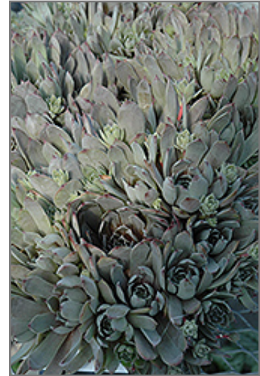
Big Blue Hens And Chicks

Big Blue Hens And Chicks is recommended for the following landscape applications;