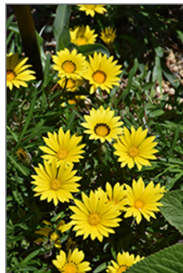
Colorado Gold Gazania flowers