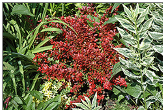
Cherry Bomb Japanese Barberry