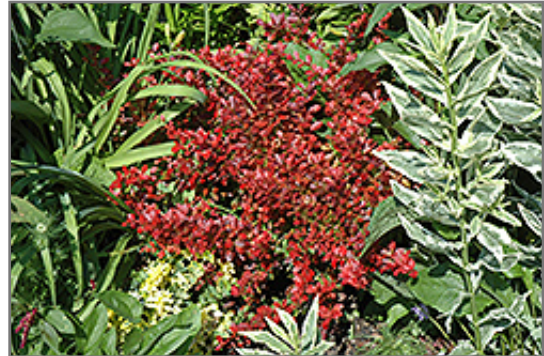
Cherry Bomb Japanese Barberry

Cherry Bomb Japanese Barberry is recommended for the following landscape applications;