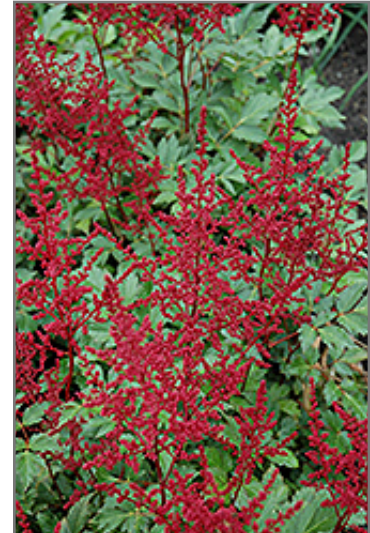
Red Sentinel Astilbe flowers

Red Sentinel Astilbe is recommended for the following landscape applications;