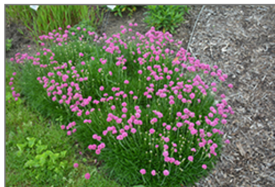
Bloodstone Sea Thrift in bloom