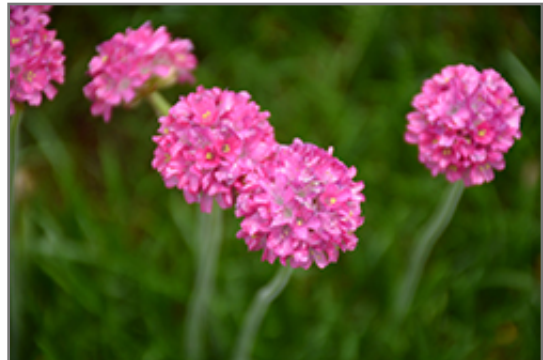
Bloodstone Sea Thrift flowers

Bloodstone Sea Thrift will grow to be only 6 inches tall at maturity extending to 10 inches tall with the flowers, with a spread of 18 inches. Its foliage tends to remain low and dense right to the ground. It grows at a slow rate, and under ideal conditions can be expected to live for approximately 10 years. As an evergreen perennial, this plant will typically keep its form and foliage year-round.