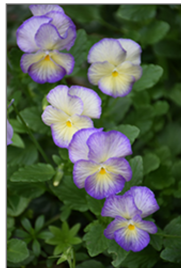
Etain Pansy flowers

Etain Pansy is recommended for the following landscape applications;