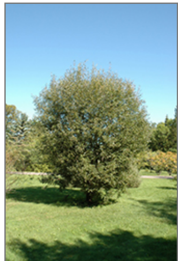
Pussy Willow