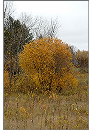
Pussy Willow in fall

This shrub does best in full sun to partial shade. It is quite adaptable, preferring to grow in average to wet conditions, and will even tolerate some standing water. It is not particular as to soil type or pH. It is somewhat tolerant of urban pollution. This species is native to parts of North America.