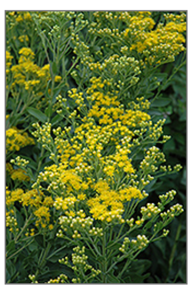
Stiff Goldenrod flowers