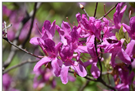
Lilac Lights Azalea flowers