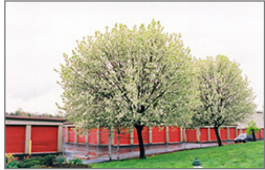
Bradford Ornamental Pear in bloom