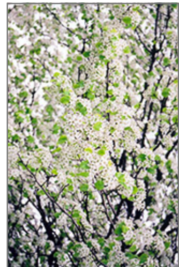
Bradford Ornamental Pear flowers