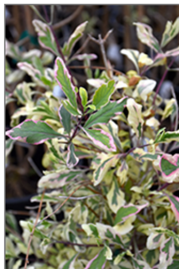
Harlequin Honeysuckle foliage