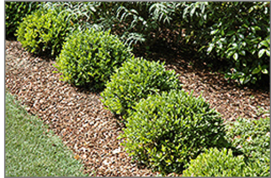
Green Velvet Boxwood

Green Velvet Boxwood is recommended for the following landscape applications;