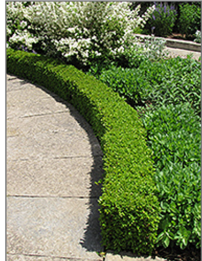
Green Velvet Boxwood

Green Velvet Boxwood makes a fine choice for the outdoor landscape, but it is also well-suited for use in outdoor pots and containers. Because of its height, it is often used as a 'thriller' in the 'spiller-thriller-filler' container combination; plant it near the center of the pot, surrounded by smaller plants and those that spill over the edges. Note that when grown in a container, it may not perform exactly as indicated on the tag - this is to be expected. Also note that when growing plants in outdoor containers and baskets, they may require more frequent waterings than they would in the yard or garden.