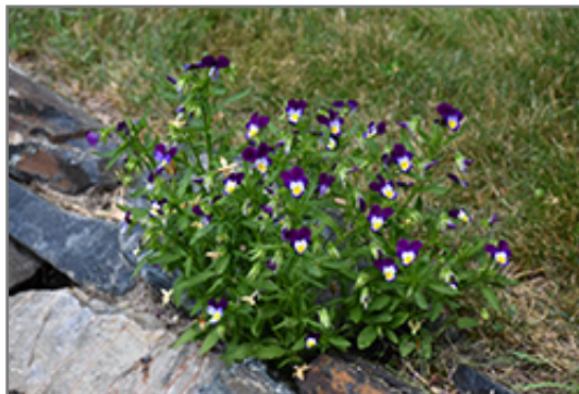
Johnny Jump-Up in bloom

Johnny Jump-Up will grow to be only 4 inches tall at maturity extending to 6 inches tall with the flowers, with a spread of 6 inches. When grown in masses or used as a bedding plant, individual plants should be spaced approximately 5 inches apart. It grows at a fast rate, and tends to be biennial, meaning that it puts on vegetative growth the first year, flowers the second, and then dies. However, this species tends to self-seed and will thereby endure for years in the garden if allowed. As an herbaceous perennial, this plant will usually die back to the crown each winter, and will regrow from the base each spring. Be careful not to disturb the crown in late winter when it may not be readily seen!