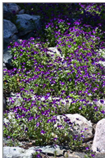
Johnny Jump-Up in bloom