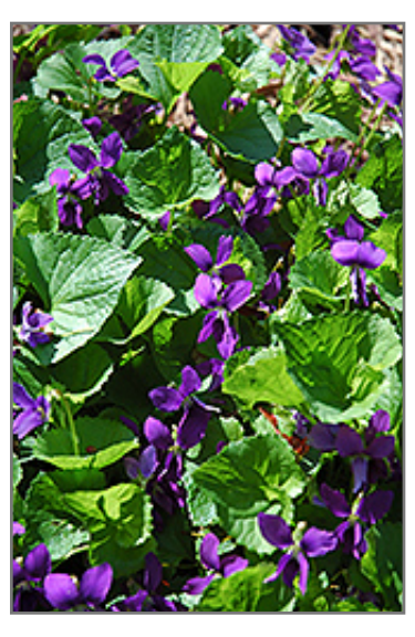
Blue Marsh Violet flowers