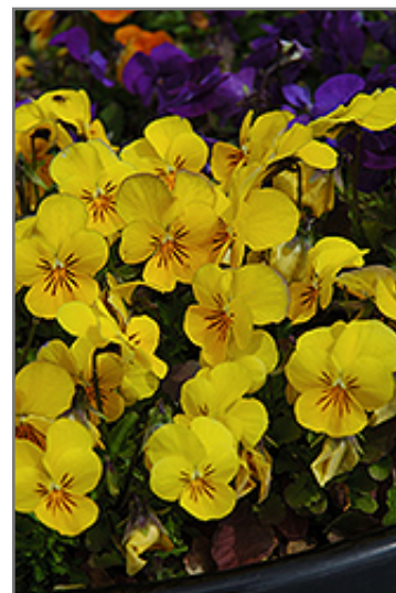
Penny Yellow Pansy flowers

This plant will require occasional maintenance and upkeep, and should only be pruned after flowering to avoid removing any of the current season's flowers. Deer don't particularly care for this plant and will usually leave it alone in favor of tastier treats. Gardeners should be aware of the following characteristic(s) that may warrant special consideration;