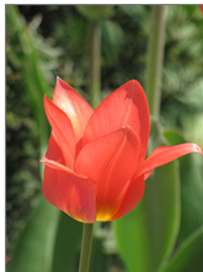
Red Emperor Tulip flowers