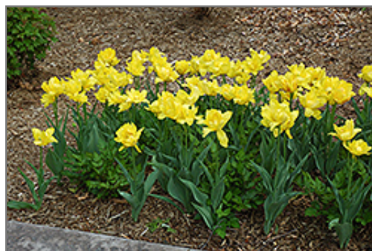
Monte Carlo Tulip in bloom