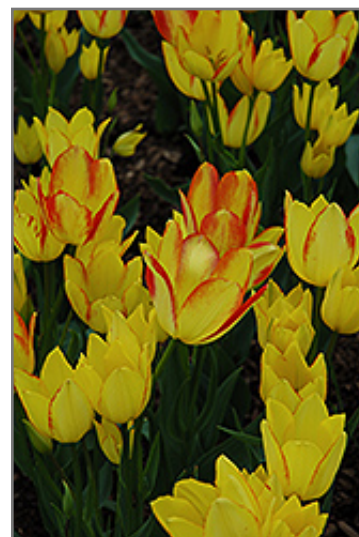
Georgette Tulip flowers