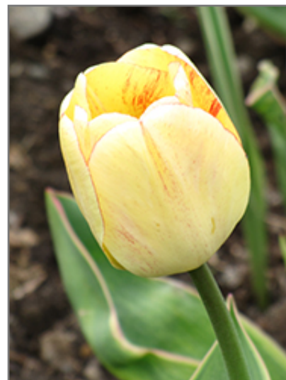
Garant Tulip flowers