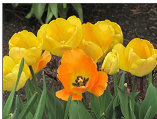
Daydream Tulip in bloom