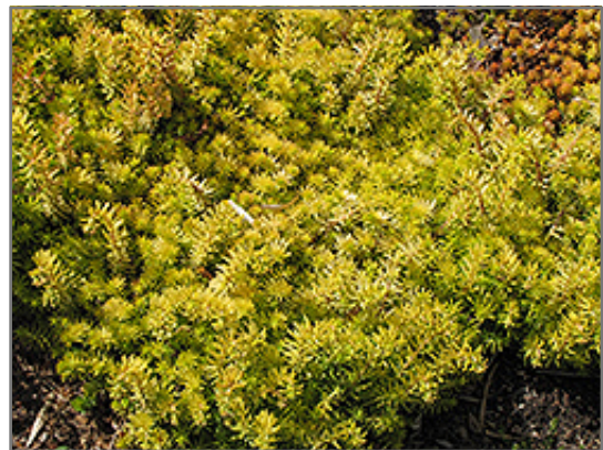
Angelina Stonecrop