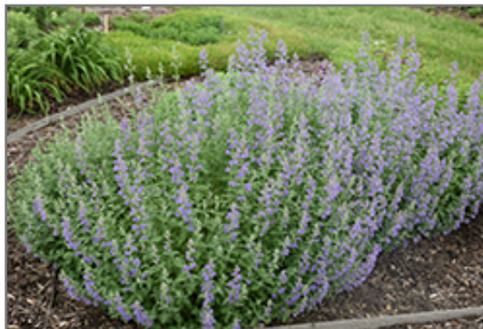
Walker's Low Catmint in bloom

Walker's Low Catmint is recommended for the following landscape applications;