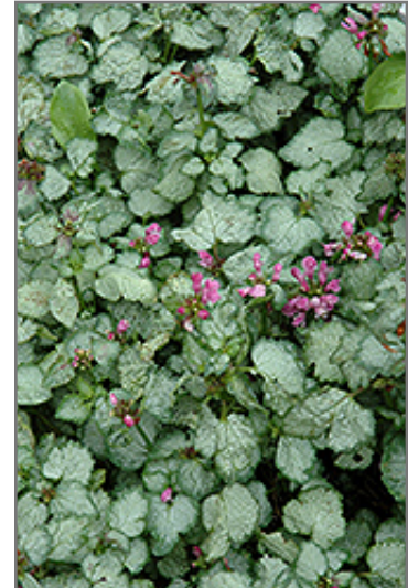
Beacon Silver Spotted Dead Nettle flowers

Beacon Silver Spotted Dead Nettle is recommended for the following landscape applications;