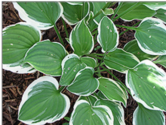
Diamond Tiara Hosta foliage