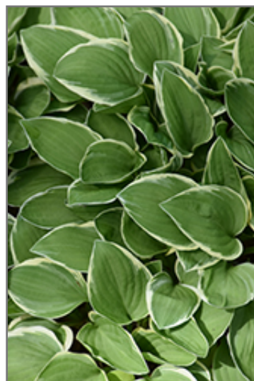
Diamond Tiara Hosta foliage