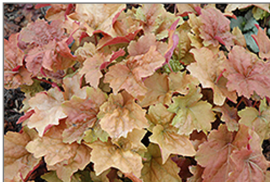
Dolce Creme Brulee Coral Bells foliage

This is a relatively low maintenance plant, and should be cut back in late fall in preparation for winter. It is a good choice for attracting hummingbirds to your yard. It has no significant negative characteristics.