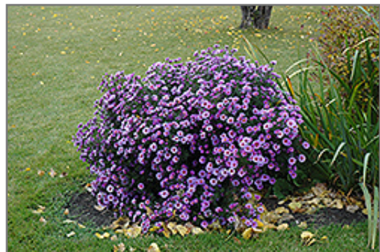
Purple Dome Aster in bloom