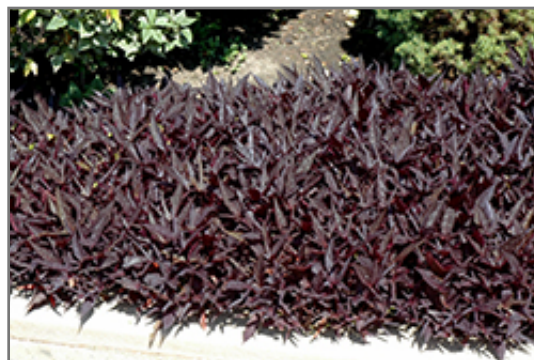
SolarPower Black Sweet Potato Vine