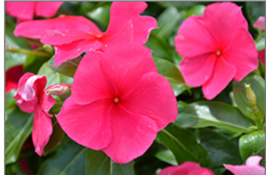
Valiant Punch Vinca flowers

Valiant Punch Vinca will grow to be about 12 inches tall at maturity, with a spread of 18 inches. Its foliage tends to remain dense right to the ground, not requiring facer plants in front. Although it's not a true annual, this fast-growing plant can be expected to behave as an annual in our climate if left outdoors over the winter, usually needing replacement the following year. As such, gardeners should take into consideration that it will perform differently than it would in its native habitat.