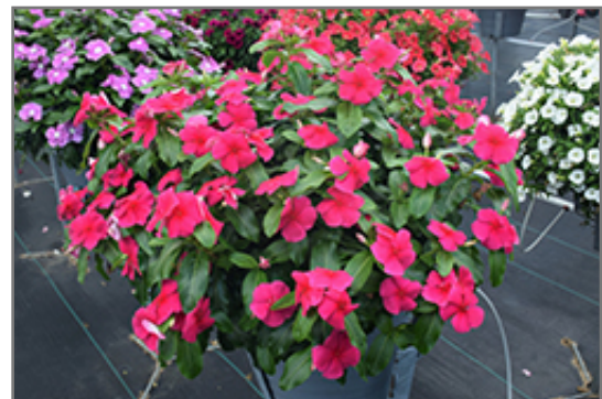
Valiant Punch Vinca in bloom