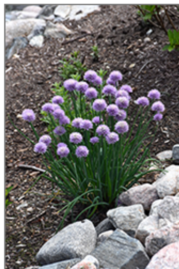
Chives in bloom